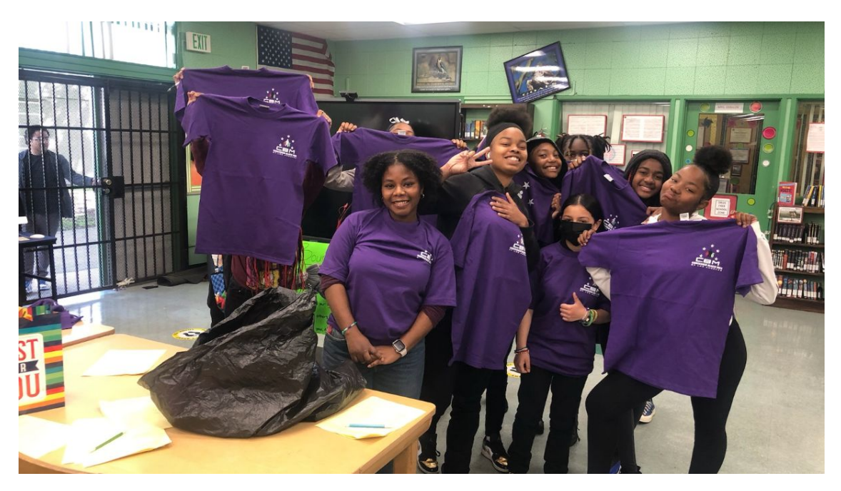
Welcome to Womanhood - Los Angeles

Our Welcome to Womanhood - LA is expanding. One of our most recent programs has been at Enterprise Middle School (2600 W Compton Blvd.). This is a select group of 11 chosen students chosen by the Principal or by student interest in the program. Our most recent meeting was Thursday, Feb. 16, from 8:30-10 a.m. *