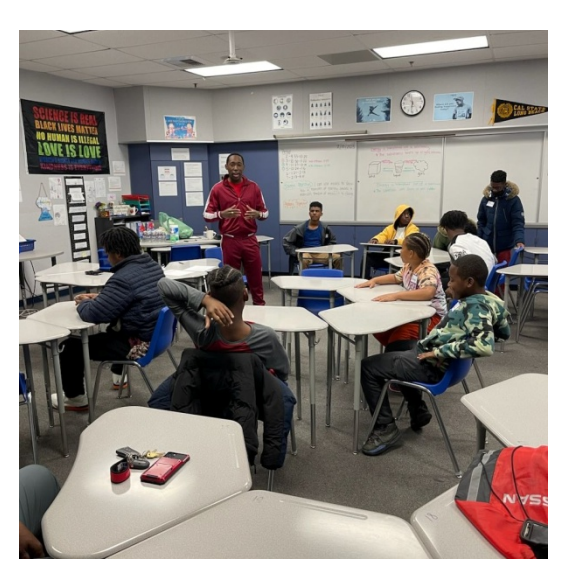
Welcome to Manhood