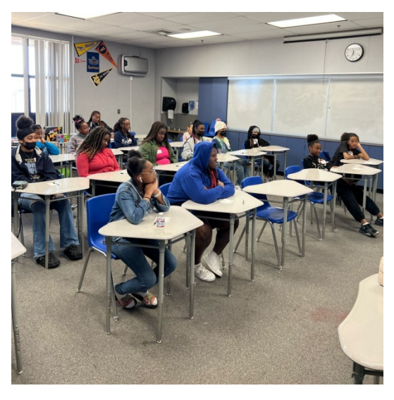
Welcome to Womanhood